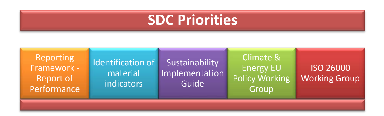
Annex B - UITP Business Plan 2013-15

They published the new group's first CSR report on 2011 in mid year; and are now embarking on following the GRI process, expecting to achieve an application level C for 2012 and improving from then on. Changes at shareholder level have been a distraction (Veolia Environment reducing its stake) but the situation is now much clearer. The business environment is still very tough.